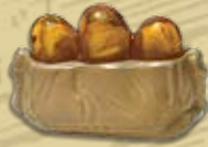
THE SANKARA STONES